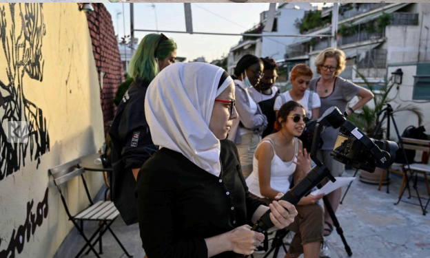
GlobalGirl Media Greece at the panel discussion of "Over To Her"

Beijing +25 commemorated the 25th anniversary of the Beijing Declaration and Platform for Action and served as a rallying point to demand and uphold human rights for all women and girls. The Generation Equality Forum (GEF), which consisted of two forums, one held in Mexico City in March 2021 and one in Paris in June 2021, was organized on the occasion of Beijing +25, and convened civil society, governments, multilateral institutions, and the private sector, to make and implement bold commitments over the coming five years to accelerate progress towards gender equality.