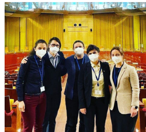
Youth LGBT organization Deystvie-Bulgaria

Bulgaria did not recognize same-sex marriages, and as a result, had previously refused to grant birth certificates and identity papers to children born to parents of the same sex. Thanks to the advocacy of UAF grantee Deystvie, this is no longer the case. Using funding from UAF, Deystvie raised awareness of the issue using video and media coverage to reach thousands of people across Bulgaria and Europe, and also participated in a hearing before the Court of Justice of the European Union.