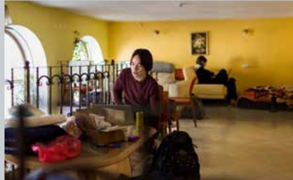
Women's Network for Dialogue and an Inclusive Peace | WNDIP-3

As the war continues, we aim to continue to resource the resilience of feminist movements in Ukraine by enhancing the collective care, protection, and survival of feminist activists, particularly those from and advocating for marginalized communities, and by supporting the sustenance of their activism and organizing efforts. When the war ends, we will support feminist activists as they rebuild, cope with the outcomes of the conflict, and rehabilitate their communities.