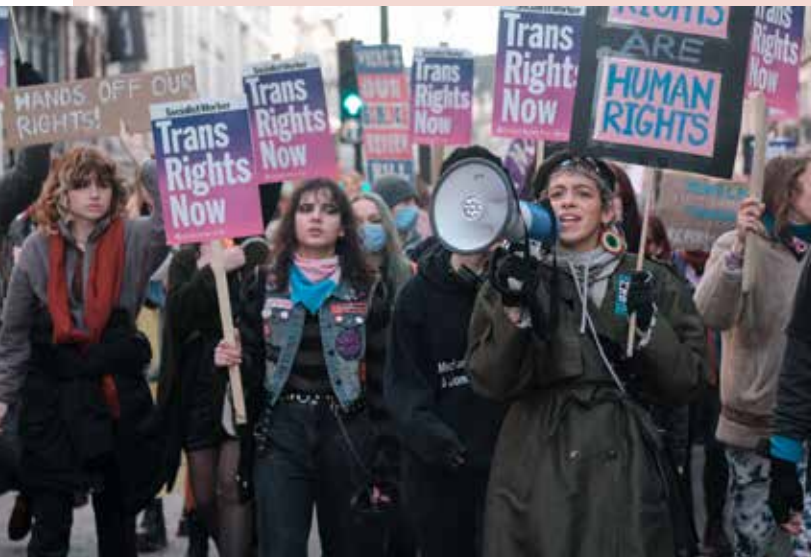
Trans Rights Now

Our vision is for feminist leadership and activism to be at the forefront of the current moment, leading the charge around finding and implementing effective solutions, and also for women, trans, and gender expansive activists to be protected, sustained, and amplified in their transformative organizing.