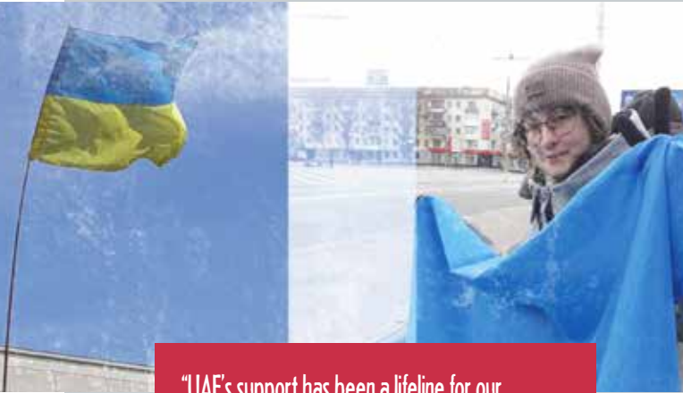
The Power of Story Telling

“UAF’s support has been a lifeline for our feminist organization, allowing us to continue our critical work in the face of numerous challenges and obstacles. Your commitment to supporting women’s rights and gender equality has made a real difference in the lives of those we serve.”