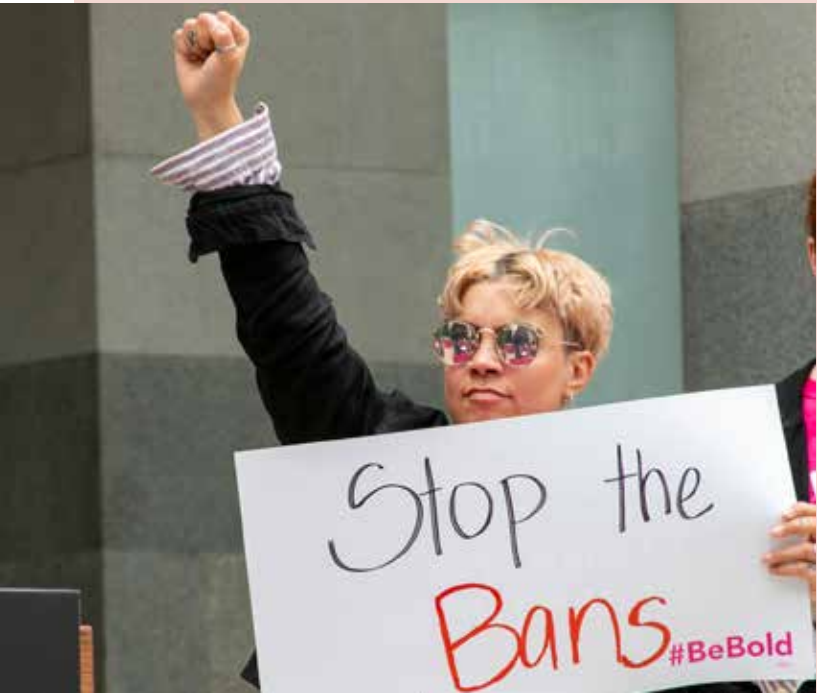
Stop The Ban

In 2022 and in the years ahead, Urgent Action Fund aims to continue our efforts supporting feminist activists working to protect democracy and participatory governance, advance Black and Indigenous leadership, and strengthen environmental and climate justice and collective care efforts in the United States.