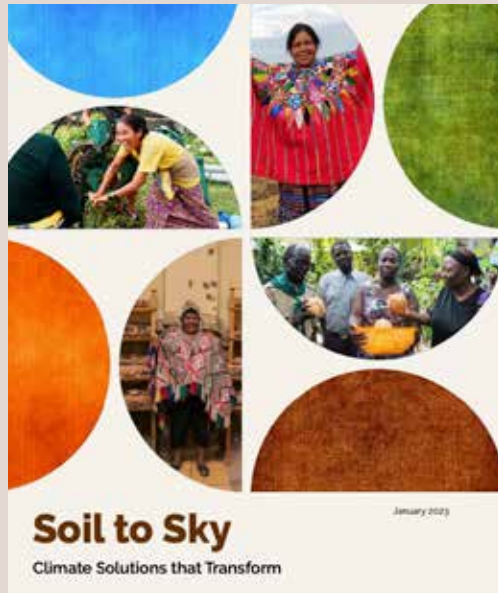
Soil to Sky | Climate Solutions that Transform Cover

The CLIMA Fund, a collaboration among Urgent Action Fund, Thousand Currents, Grassroots International, and Global Greengrants Fund, mobilizes resources to support grassroots solutions to the climate crisis.