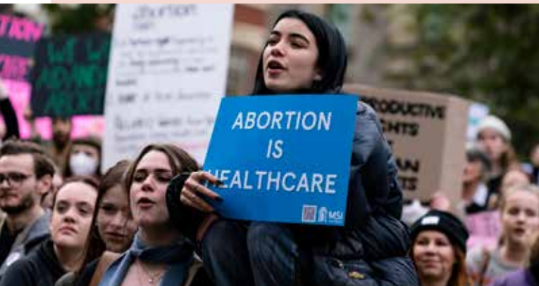
Roe v Wade Overturned Protest

In 2022 grassroots feminist movements reached a pivotal juncture. Threats and growing attacks to bodily autonomy, self-determination, and democracy increased in the United States and around the world. As movements aimed to care for their communities who are facing volatile conditions, they also sought to build power to protect democracy and human rights.